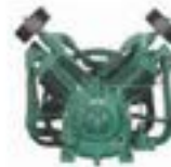
BARE COMPRESSOR PUMP